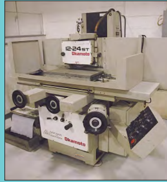
12" X 24" Okamoto Model ACC-1224 ST Hydraulic Surface Grinder