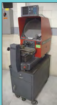
14" Starrett Model HB350 Optical Comparator