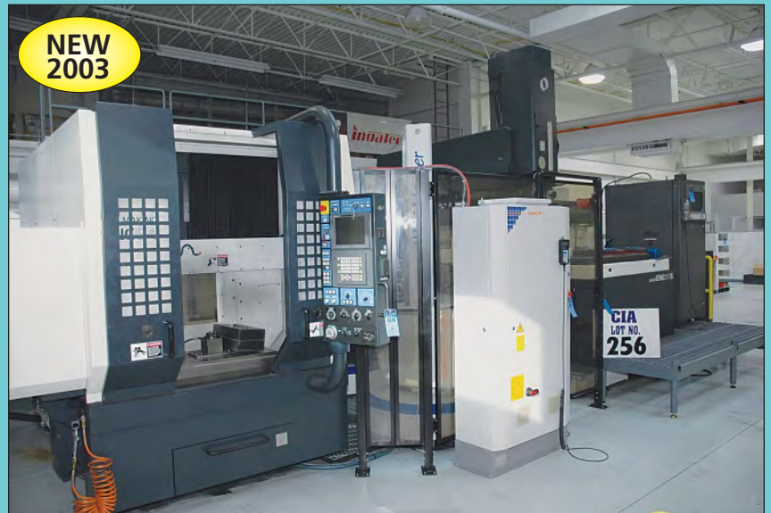
Overall View Automated Electrode Machining and EDM Cell w/ Makino EDNC-106S EDM, Makino SNC-64 Graphical CNC VMC, and System 3R Robot