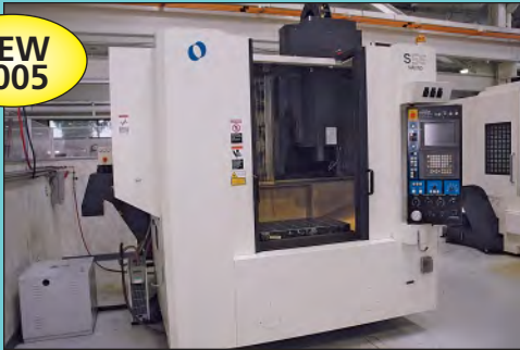
(2) Makino Model S-56 CNC Vertical Machining Centers