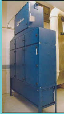
15 HP Torit Model MDV-9000 Three-Stage Mist Collector