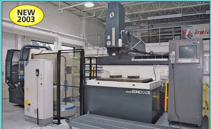
Overall View Automated Electrode Machining and EDM Cell w/ Makino EDNC-106S EDM, Makino SNC-64 Graphic CNC VMC, and System 3R Robot