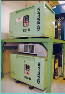
Bank View Late Model Sullair Air Compressors