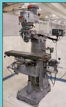
2 HP Bridgeport Series I Vertical Milling Machine