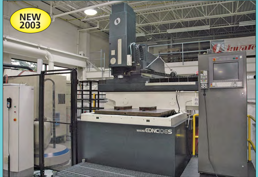
Makino Model EDNC 106S Four-Axis CNC Die Sinker EDM Machine

System 3R Workmaster Type K-50623 Automatic Tool Changer Robot; S/N 0301-V06-R209, For Automatic Changing of Work Pieces in Machines, Three-Axis Machine, (360) Piece Work Piece Carousel, Pendant Control, Services both above Machines ( New 2003 ) SEE PHOTO