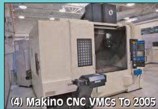
(4) Makino CNC VMCs To 2005

2020 DUNLAP ST., CINCINNATI, OHIO 45214 PHONE (513) 241-9701 / FAX (513) 241-6760 INTERNET: cia-auction.com