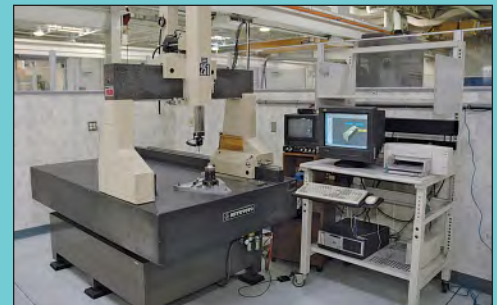
Mitutoyo Model B-251 Coordinate Measuring Machine