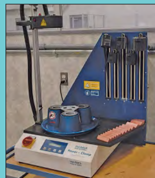
Haimer Model PC-2000 Shrink Fit Power Clamp

(20) No. 30 Taper Tool Holders of All Types