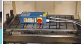
(2) Makino Model S-56 CNC Vertical Machining Centers