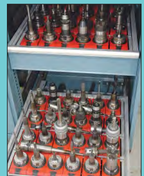
(175) HSK 63 Taper Tool Holders of All Types