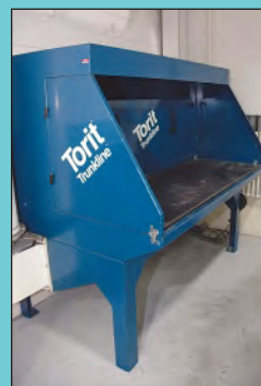
28" X 72" Torit Model RWB-3000 Welding Bench