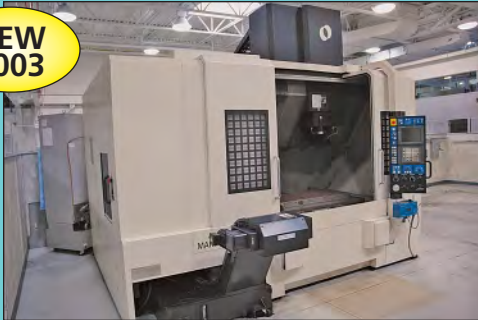
Makino Model V-77 CNC Vertical Machining Center