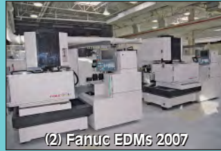
(2) Fanuc EDMs 2007