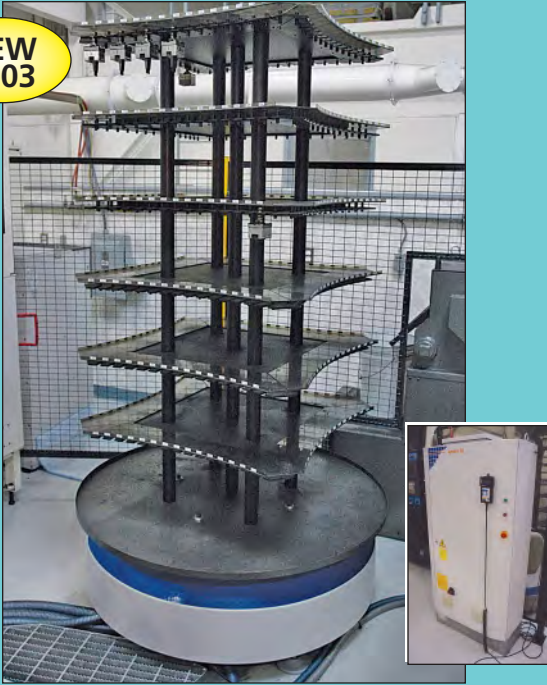
System 3R Workmaster Type K-50623 Automatic Tool Changer Robot Carousel and Control View