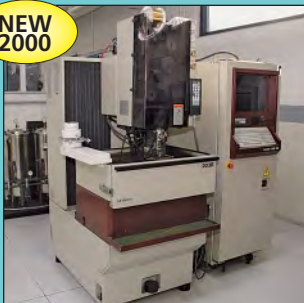
Hitachi Model 203R CNC Wire EDM