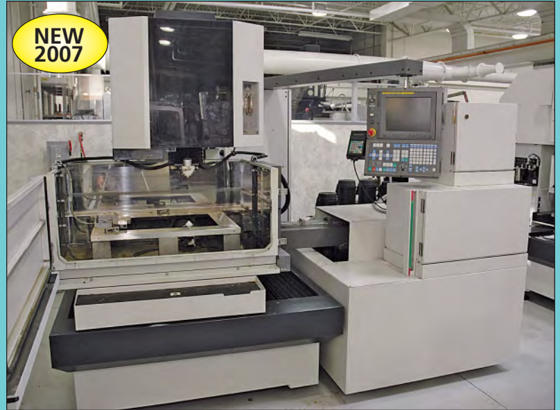
Fanuc Model Robocut Alpha 1iC CNC Wire EDM