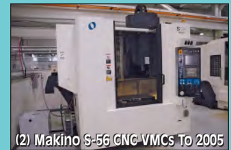
(2) Makino S-56 CNC VMCs To 2005