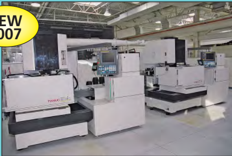
(2) Fanuc Model Robocut Alpha 11C CNC Wire EDM's