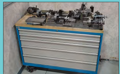
Partial View Large Quantity Grinding and Machine Accessories