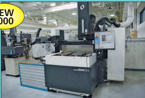
Makino Model EDNC 65 Four-Axis Bridge Type CNC Die Sinker EDM

Featuring: (2) Makino S56 CNC VMC's (2005), Makino V77 CNC VMC (2002), Makino SNC64 CNC Graphite VMC (2003), OKK DMG400 CNC Graphite VMC (1998), Makino EDNC106S CNC Sinker EDM (2003), Makino EDNC65 CNC Die Sinker EDM (2003), (2) Fanuc Robocut Wire EDM's (2007), Makino SP-43 CNC Wire EDM (2002), System 3R-360 Robotic Tool Changing System (2003), Xermac & Belmont EDM Sinker, Hitachi 203R Wire EDM, Bridgeport VMC-1000-30 VMC (1997), Bridgeport Series I & Interact Mills, Okamoto 1224ST Hyd. Surface Grinder, (4) 6" x 18" Parker Majestic Surface Grinders, Torit Dust Collectors, Inspection Equipment, Lift Trucks, Air Compressors, Misc. Machinery, Machine Accessories, Late Model Ultra Clean Shop Equipment