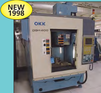
OKK Model DGM 400 CNC Bridge Type Graphite Machining Center