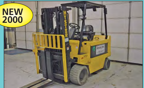
12,000 Lb Hyster Model E120XL2 Sit Down Electric Lift Truck