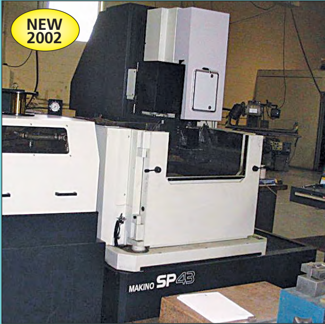
Makino Model SP-43 CNC Wire EDM