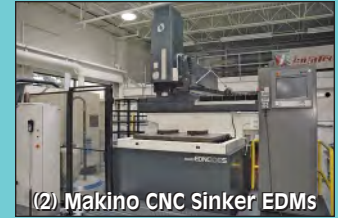
(2) Makino CNC Sinker EDMs