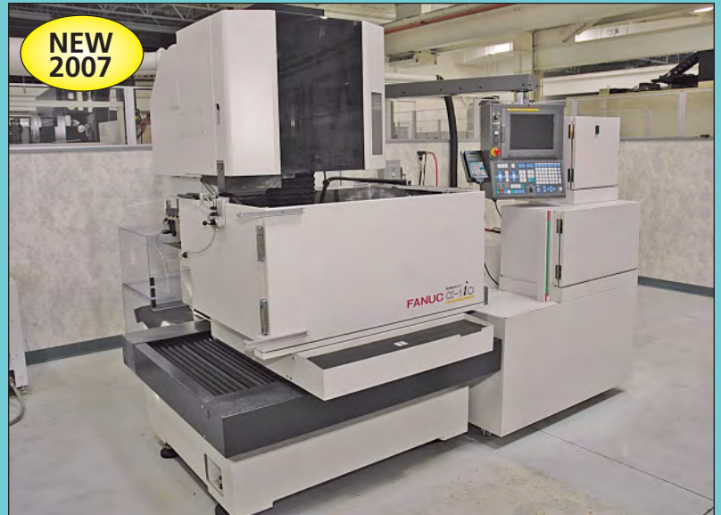
Fanuc Model Robocut Alpha 1iC CNC Wire EDM

Late Model Shop Equipment Consisting of; (7) Portable & Standard Lista Multi-Drawer Tooling Cabinets, HD Steel Die Set-Up Tables, Gesswein Die Polisher, Bench Grinders, C-Clamps, Electric Hand Tools, (9) Sections 36" X 96" Pallet Rack, Pallet Trucks, Steel Shelving, Workbenches, Shop Carts, Assorted Hand Tools & Other Related Items