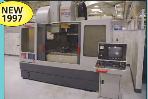
Bridgeport Model VMC 1000-30 CNC Vertical Machining Center