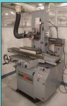
(3) 6" X 18" Parker Majestic Hand Feed Surface Grinders