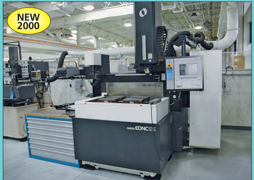
Makino Model EDNC 65 Four-Axis Bridge Type CNC Die Sinker EDM