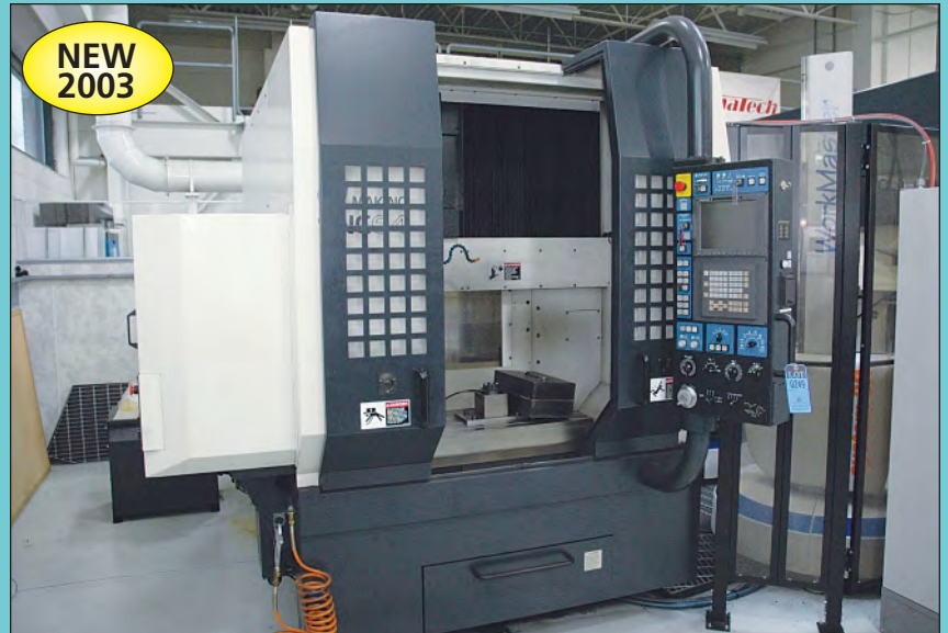
Makino Model SNC-64GS High Speed CNC Graphite Vertical Machining Center