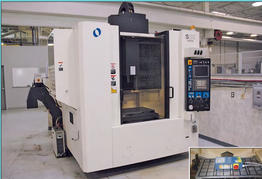
(2) Makino Model S-56 CNC Vertical Machining Centers