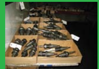
PARTIAL VIEW OF CNC TOOL HOLDERS