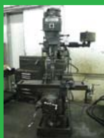
LAGUN FTV-1 VERTICAL MILL W/P.F. & DRO