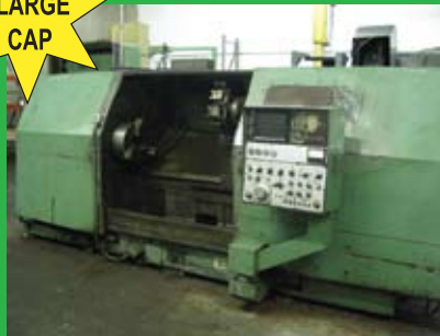
IKEGAI AX30N CNC LATHE W/FANUC 6T CONTROL, 3.5" BORE, 60" CENTERS.