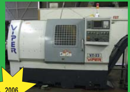
2006 2006 VIPER VT-22 CNC LATHE W/FANUC Oi-TC CONTROL