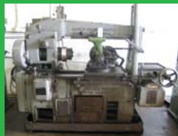
BARBER-COLEMAN TYPE-A GEAR HOBBER