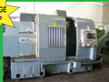
MORI-SEIKI SL-5A CNC LATHE W/FANUC 10TE CONTROL, 18" POWER CHUCK