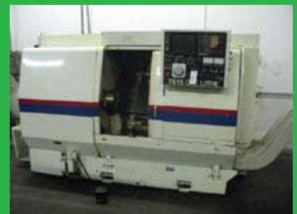
TAKISAWA TS-15 CNC LATHE W/ FANUC 6T CONTROL, 8" CHUCK