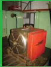
HAAS 12" 4TH AXIS ROTARY TABLE W/CONTROL BOX