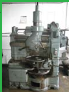
FELLOWS GEAR SHAPER