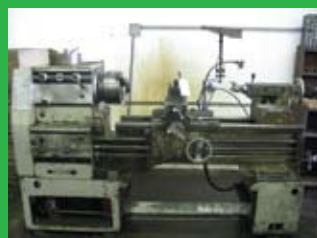
ENGINE LATHE 20x40 W/3" BORE CAP