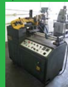
BREVETTATO TR-AU 150 AUTO BAND SAW