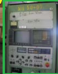
W/ FANUC 15M CONTROL