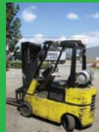
HYSTER 4000LB LPG FORKLIFT