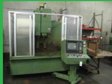
HITACHI SEIK VA35 (III) CNC VMC W/FANUC 11M CONTROL