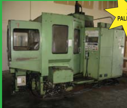
MORI-SEIKE MH-50 CNC W/FANUC 15M CONTROL, 50 TAPER, 40 ATC