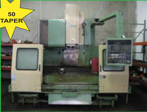
MORI SEIKI MV-55 CNC VMC W/FANUC MS-M4 CONTROL