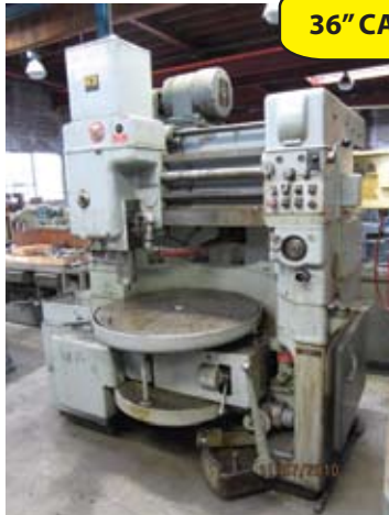
FELLOWS TYPE 36, GEAR SHAPER, 40" DIAM TABLE