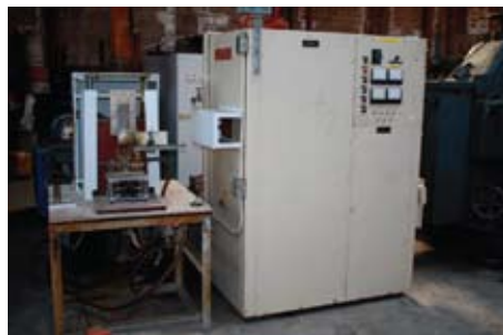
TOCCOTRON INDUCTION HEATER MOD 4EG-301-53