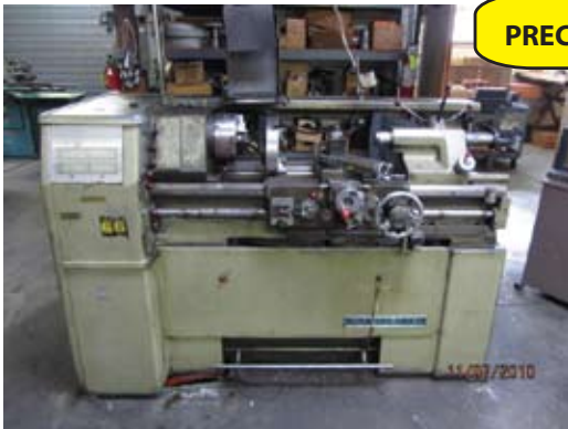
CAZENEUVE MODEL 360 TOOL ROOM LATHE, 13"x36"