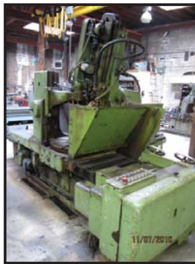
NILES ZSTZ 800, SPUR & HELICAL GEAR GRINDER, 36" ROTARY TABLE