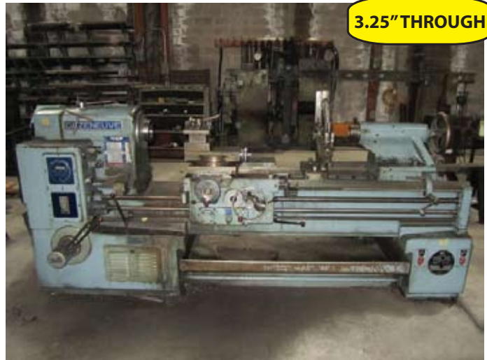
CAZENEUVE MODEL 725, 24"/36" x60" LATHE