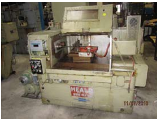
HEALD BORE-MATIC GUN DRILL, 24" STROKE, M-22-101-01 SN:36823

INSPECTION TOOL DEPT, GEAR CENTERS, SUNNEN GAGES, PRATT AND WHITNEY SUPER MICS, 100'S OF INSPECTION TOOLS, MICS, GAGES, THREAD GAGES, CALLIPERS, AND ETC.