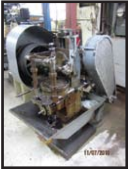
ADAMS/FARWELL #1 GEAR HOBBER, SPIRAL DRIVE