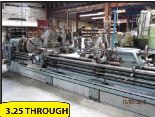
CAZENEUVE MODEL 725 24" x17 FT LATHE, ENG/MET THREADING

LOCATION 2897 CHAPMAN ST. OAKLAND, CA 94601