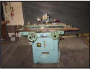
TOS BN102A TOOL & CUTTER GRINDER