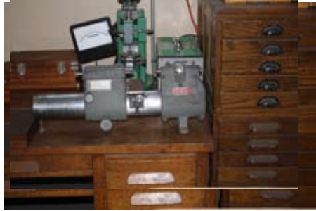
PRATT & WHITNEY SUPER MIC