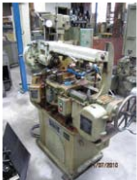
BARBER-COLMAN, MODEL 610 GEAR HOBBER

GEAR MFG. EQUIPMENT: NEWARK #5 GEAR HOBBER, 72" CAP, SINGLE INDEX AND TANGENTIAL ATTACHMENT, 41" DIAMETER TABLE, GEAR HOBBIING OR SINGLE INDEXING. NILES ZSTZ 800, SPUR AND HELICAL GEAR GRINDER, 36" ROTARY TABLE, 31.5" CAP, DOES 45 DEGREE HELIS EITHER SIDE. MAAG HSS 60 BC, 24" SPUR AND HELICAL GEAR GRINDER. FELLOWS #12 GEAR SHAPER, 4" RISER BLOCK, 4" CUTTER ELEVATION, VAR SPEED ON STROKE AND FEED, 20" DIAMETER TURN TABLE, S/N 30034. FELLOWS TYPE 36, GEAR SHAPER, 40" DIAMETER TABLE, 36" CAP GEAR CUT I.D. AND O.D., 7" STROKE, S/N 31802. FELLOWS GEAR MEASUREMENT INSTRUMENT MODEL # 4, S/N 31661-953. LEES BRADNER #8 THREAD MILL, 4.5 FT CENTERS, 2.65" THROUGH HOLE, 20" SWING OVER WAYS, AND 10" SWING OVER CARRIAGE. GLEASON #12 BEVEL GEAR GENERATOR. KLINGELBERG GW 30 GEAR HOB SHARPENER WITH HELIX ATTACHMENT. KLOCKNER AG 30 HOG GRINDING MACHINE. BARBER COLEMAN MODEL 610 GEAR HOBBER, S/N 3215624. ADAMS FARWELL #1 GEAR HOBBER, SPIRAL DRIVE. MITTS AND MERRILL #2 KEYSEATER, 1 1/4" CAP, 13" STROKE, TOOLED. HEALD BORE-MATIC GUN DRILL, MODEL M-22-101-01, 24" STROKE, S/N 36823. 100'S OF GEAR CUTTING TOOLS, CUTTERS, TOOLING, AND SUPPORT.