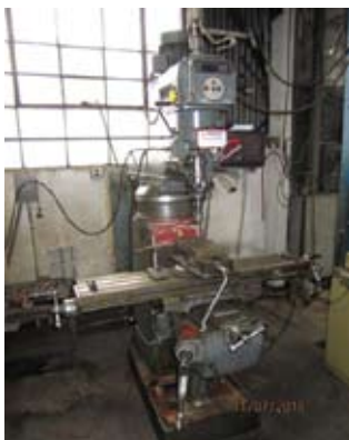
LAGUN FTV-2 VERTICAL MILL DRO. P.F. 9x48