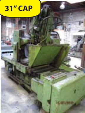
NILES ZSTZ 800, SPUR & HELICAL GEAR GRINDER