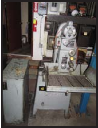
SUNNEN MBB-1600 HONNING MACHINE