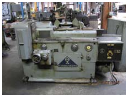
KLINGELBERG GW 30 GEAR HOB SHARPENING MACHINE