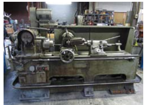
LEES-BRANER #8 THREAD MILL, 2.75" THRU HOLE, 4.5' CENTERS