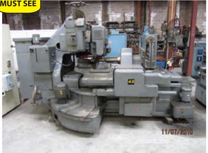
MAAG HSS60-BC, 24" SPUR & HELICAL GEAR GRINDER