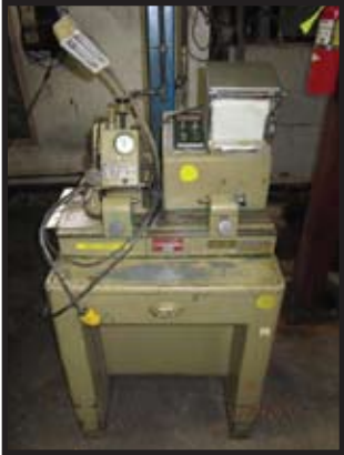
FELLOWS MODEL 4 GEAR MEASUREMENT INSTRUMENT