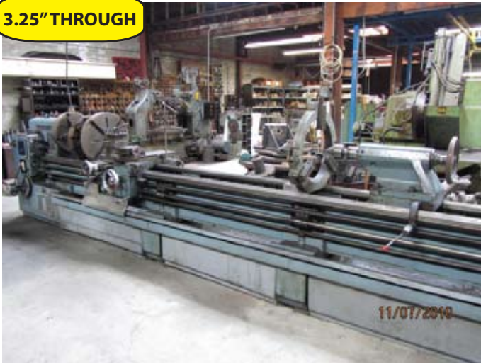
CAZENEUVE MODEL 725, 24"x17' LATHE, ENGLISH/METRIC THREADING