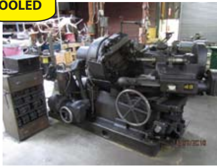
GLEASON #12 BEVEL GEAR GENERATOR