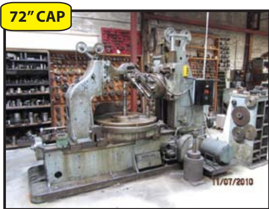
NEWARK #5 GEAR HOBBER, 41" DIAM TABLE, SINGLE INDEX