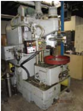
FELLOW #12 GEAR SHAPER, VAR SPEED, 20" DIAM TABLE

GEAR MFG. EQUIPMENT: NEWARK #5 GEAR HOBBER, 72" CAP, SINGLE INDEX AND TANGENTIAL ATTACHMENT, 41" DIAMETER TABLE, GEAR HOBBIING OR SINGLE INDEXING. NILES ZSTZ 800, SPUR AND HELICAL GEAR GRINDER, 36" ROTARY TABLE, 31.5" CAP, DOES 45 DEGREE HELIS EITHER SIDE. MAAG HSS 60 BC, 24" SPUR AND HELICAL GEAR GRINDER. FELLOWS #12 GEAR SHAPER, 4" RISER BLOCK, 4" CUTTER ELEVATION, VAR SPEED ON STROKE AND FEED, 20" DIAMETER TURN TABLE, S/N 30034. FELLOWS TYPE 36, GEAR SHAPER, 40" DIAMETER TABLE, 36" CAP GEAR CUT I.D. AND O.D., 7" STROKE, S/N 31802. FELLOWS GEAR MEASUREMENT INSTRUMENT MODEL # 4, S/N 31661-953. LEES BRADNER #8 THREAD MILL, 4.5 FT CENTERS, 2.65" THROUGH HOLE, 20" SWING OVER WAYS, AND 10" SWING OVER CARRIAGE. GLEASON #12 BEVEL GEAR GENERATOR. KLINGELBERG GW 30 GEAR HOB SHARPENER WITH HELIX ATTACHMENT. KLOCKNER AG 30 HOG GRINDING MACHINE. BARBER COLEMAN MODEL 610 GEAR HOBBER, S/N 3215624. ADAMS FARWELL #1 GEAR HOBBER, SPIRAL DRIVE. MITTS AND MERRILL #2 KEYSEATER, 1 1/4" CAP, 13" STROKE, TOOLED. HEALD BORE-MATIC GUN DRILL, MODEL M-22-101-01, 24" STROKE, S/N 36823. 100'S OF GEAR CUTTING TOOLS, CUTTERS, TOOLING, AND SUPPORT.