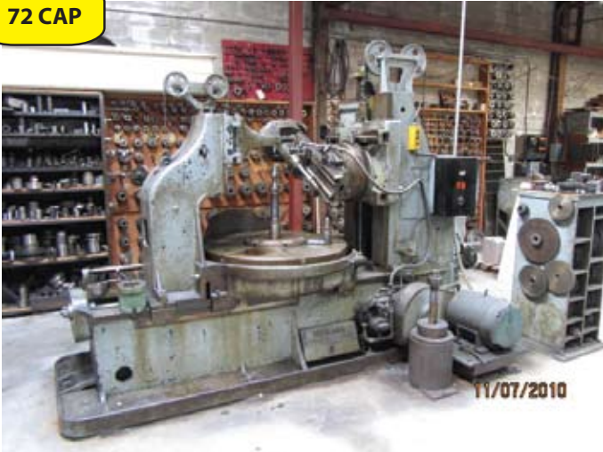
NEWARK #5 GEAR HOBBER, 41" DIAM TABLE, SINGLE INDEX