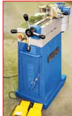
E.G. HELLER'S SON ELECTRIC TUBE BENDING MACHINE

DELTA Vertical Band Saw , 14" table, 12" cap.