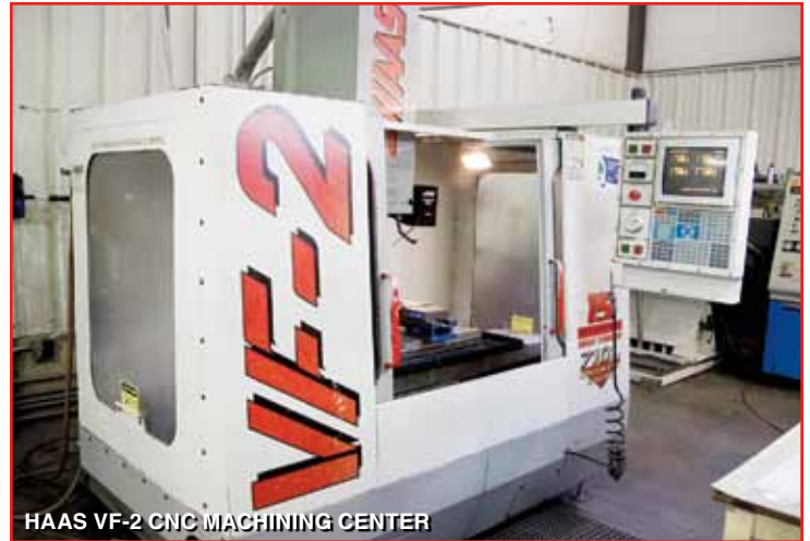
HAAS VF-2 CNC MACHINING CENTER