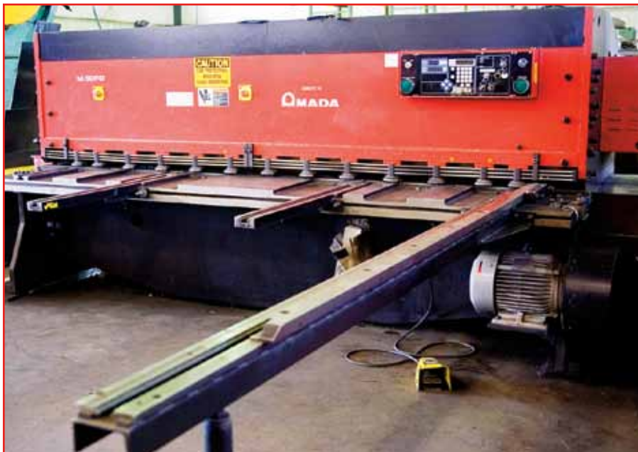
AMADA 1/4" X 10' MECHANICAL POWER SHEAR

AMADA 1/4" x 10' Mechanical Power Shear, Mdl. M-3060, S/N 30600976, new 1996, power front operated programmable back gauge, 11' squaring arm, support arms, rear sheet support system.