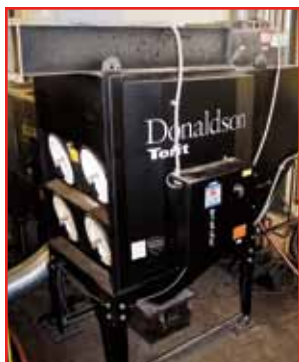
DONALDSON TORIT DUST COLLECTOR