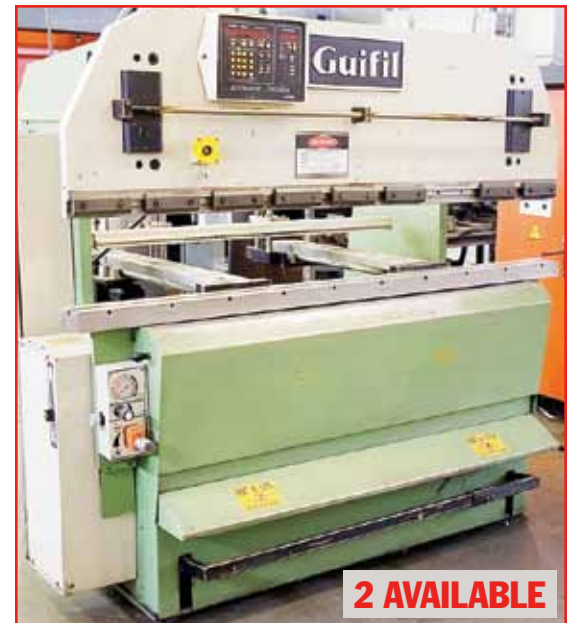
GUIFIL 6.5" X 69.3-TON CNC HYDRAULIC PRESS BRAKE