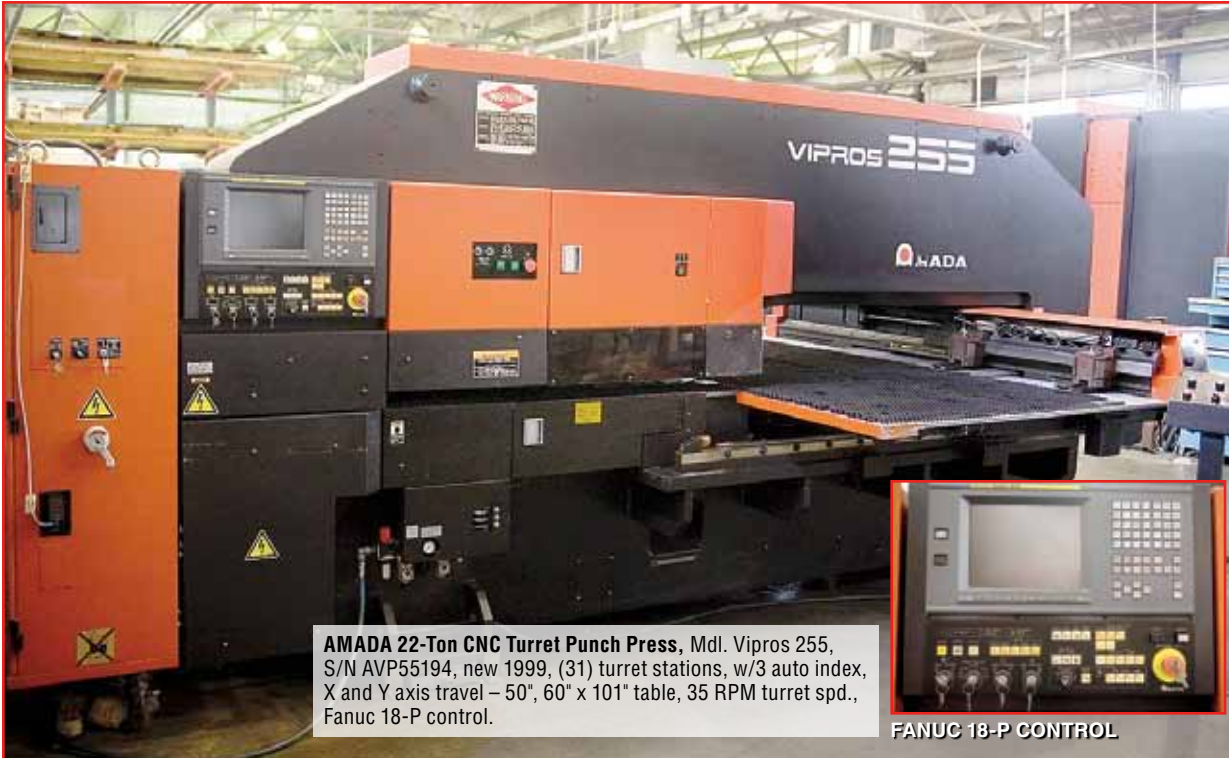
AMADA 22-Ton CNC Turret Punch Press , Mdl. Vipros 255, S/N AVP55194, new 1999, (31) turret stations, w/3 auto index, X and Y axis travel – 50", 60" x 101" table, 35 RPM turret spd., Fanuc 18-P control.