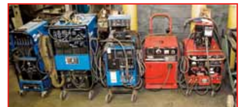
LINCOLN IDEALARC DC ARC WELDER