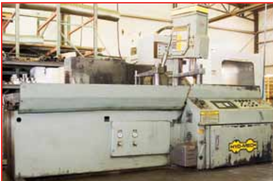
HYD-MECH VERTICAL BAND SAW

Welding Positioner , w/Vari Speed 0–5° tilt, 12-1/4" table.