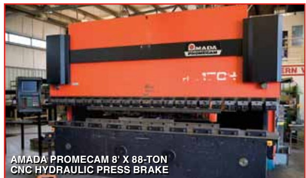
AMADA PROMECAM 8' X 88-TON CNC HYDRAULIC PRESS BRAKE