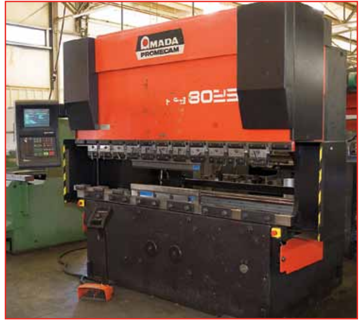
AMADA PROMECAM 8' X 88-TON CNC HYDRAULIC PRESS BRAKE

AMADA Promecam 14' x 187-Ton CNC Hydraulic Press Brake, Mdl. HFBO 1704, S/N H970115, new 1997, 8-axis Amada Operateur control.