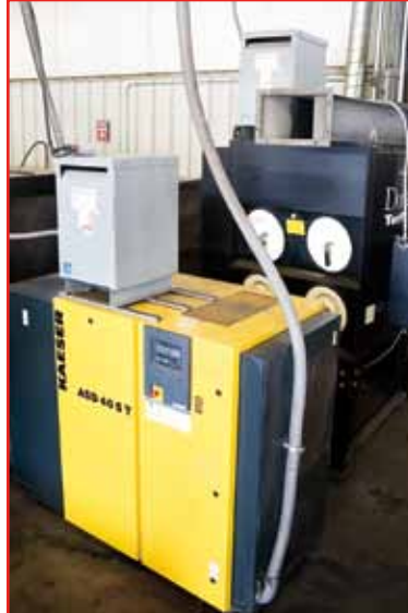
KAESER 40 HP ROTARY SCREW AIR COMPRESSOR