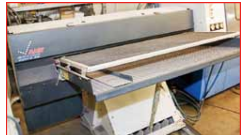
LNS QUICK LOAD SERVO S2 BARFEED, 4.75" CAP.

HAAS CNC Machining Center, Mdl. VF-2, new 1998, Haas control, 30" x 16" x 20" travels, 15 hp., 40 taper, 20 ATC, 15" x 36" table, 4th axis ready.