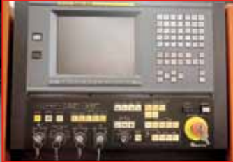
FANUC 18-P CONTROL

ROUSSELLE 70-Ton Punch Press , 16' shut height, 4" adjustment, 5" stroke, 31-7/8" x 20-1/4" table, 15" x 12" ram, bolt pattern 13" (left/right), 3-1/2" front/back.