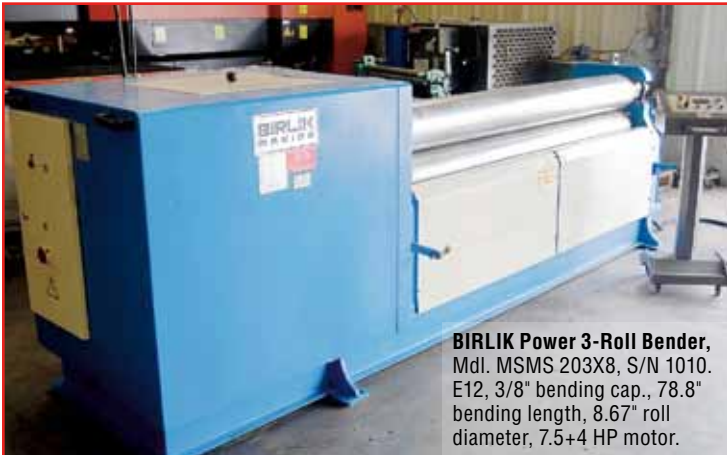
BIRLIK Power 3-Roll Bender , Mdl. MSMS 203X8, S/N 1010. E12, 3/8" bending cap., 78.8" bending length, 8.67" roll diameter, 7.5+4 HP motor.

E. G. HELLER'S SON Electric Tube Bending Machine , Mdl. Super Bender, foot control, set of dies.