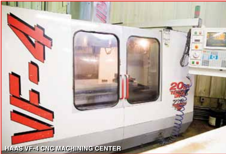
HAAS VF-4 CNC MACHINING CENTER

FANUC Robocut Alpha-1iB Wire EDM, New 2001, Fanuc i80 is-w control, 21.7" x 14.5" x 12" travels, U+V taper, AWF, 853 hours.