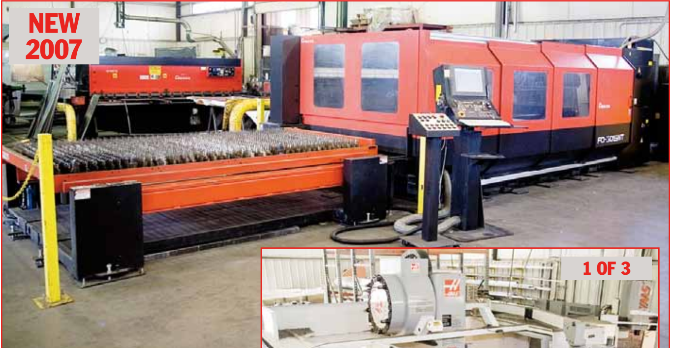
5' X 10' AMADA 4,000 WATT CNC LASER, MDL. FO 3015

On-Site Bidding in Logan, UT or Bid Via Webcast at