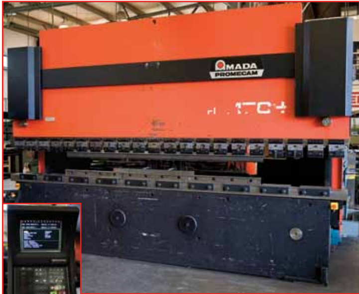
AMADA PROMECAM 14' X 187-TON CNC HYDRAULIC PRESS BRAKE