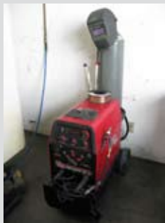
LINCOLN TIG 185, TIG WELDER