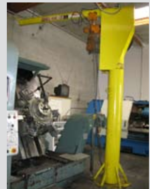
(1of3) ABELL-HOWELL, 1 TON JIB CRANES