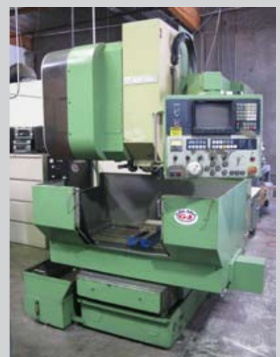
MORI SEIKI MV-JR CNC VMC W/ FANUC CONTROL, 30ATC.