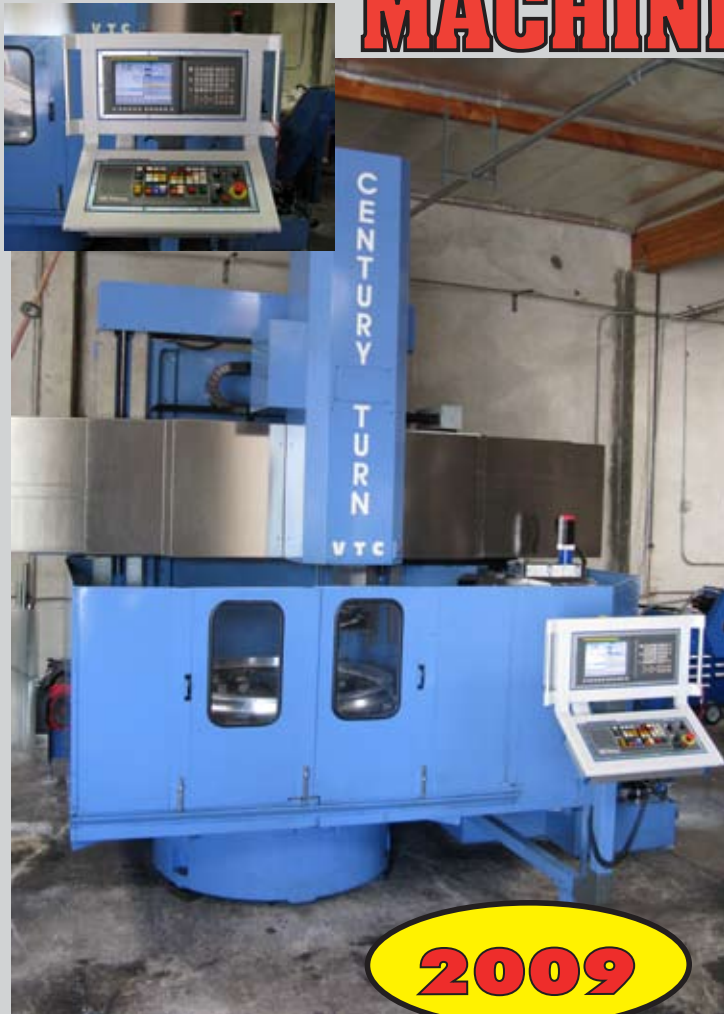
2009 CENTURY TURN 64" CNC VTC VERTICAL TURNING CENTER W/ FANUC OI-TC CONTROL, 12 ATC, 68" SWING, 43"-Z.