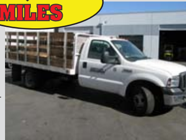
2006 FORD F-350, 12FT STAKE BED