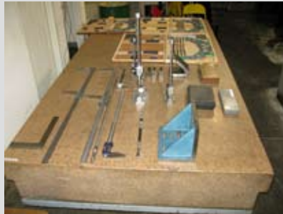
VARIOUS INSPECTION TOOLS, TOOLING, GAGES, MICROMETERS, HEIGHT GAGES, CALIPERS ETC.