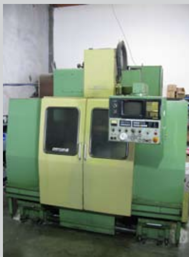
MORI SEIKI MV-40B CNC VMC W/ FANUC 10M CONTROL