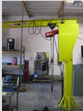
(1of3) ABELL-HOWELL, 1 TON JIB CRANES