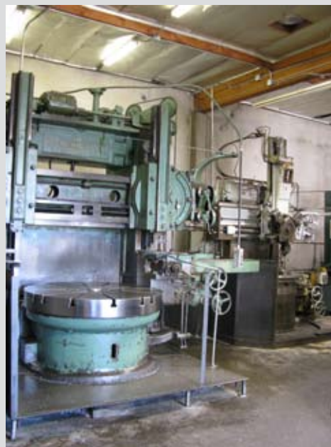
VIEW OF CONVENTIONAL VERTICAL LATHES