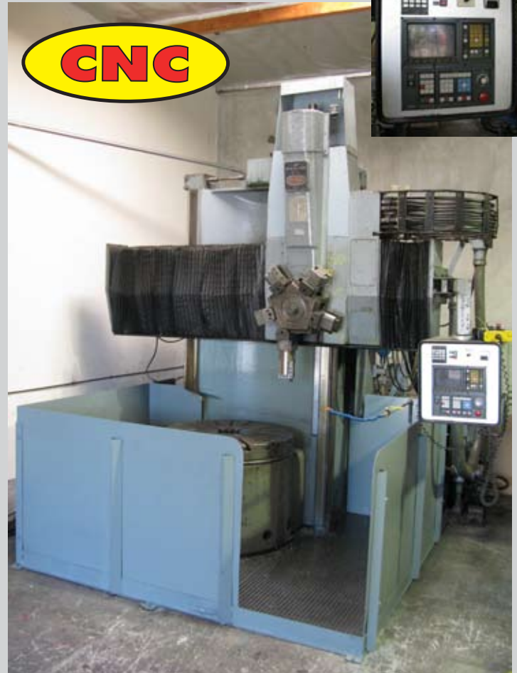
BULLARD 46" DYN-U-TAPE CNC VTL W/FANUC OTA CONTROL, 58" SWING, 5 POS. TURRET