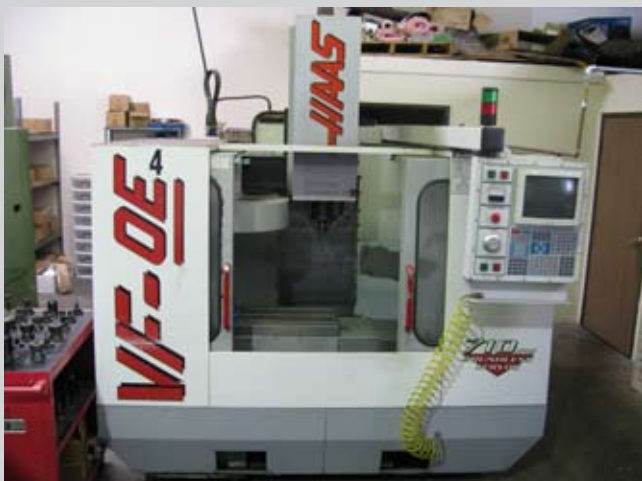
1996 HAAS VF-OE CNC VMC, 10,000 RMP