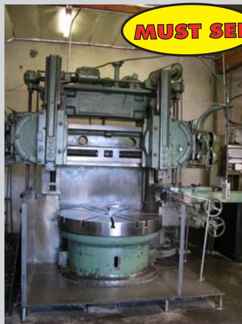
KING 62" VERTICAL BORING MILL, 68" SWING, SIDE HEAD, 4 JAW CHUCK