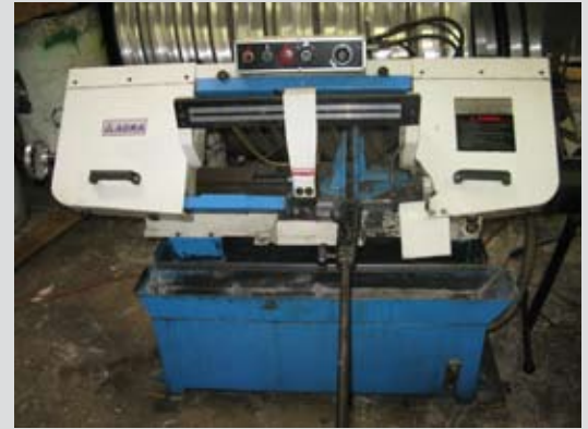
ACRA HORIZONTAL BAND SAW