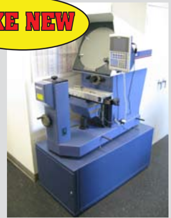
MITUTOYO PH-A14, 14" OPTICAL COMPARTOR W/ QM-DATA 200 CONTROL