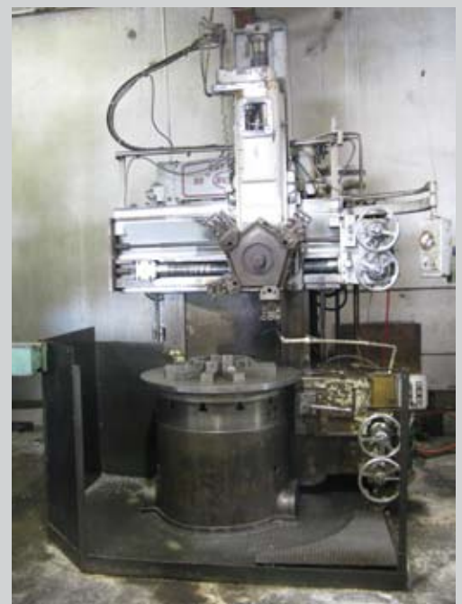
BULLARD 36" CUT MASTER VTL, 3 JAW CHUCK, 42" SWING, 5 POSITION TURRET AND SIDE HEAD