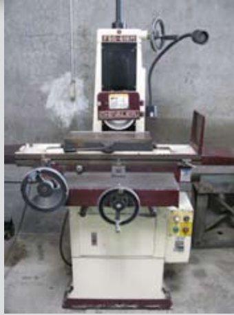
CHEVALIER FSG-618, 6X18 SURFACE GRINDER